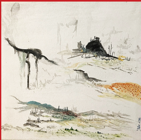
Quiet Rising I - Yumi Hogan